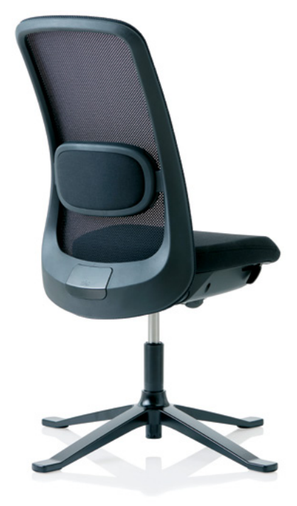
Design: Frost Produkt AS, Powerdesign AS and Flokk Design Team Patent- and design protected